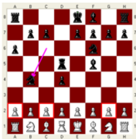
Figure 2: The seventh game. The recovered initial White's position, after the leaf-form two-sided loops Ng1-h3-g5-f3-g1 and Nb1-a3-b5-c3-b1 . White's move; it will be d2-d3 . Coordination of black figures is poor, and though the pawn at d4 is an unpleasant one, they do not form any real dagger.

move Nf3-e5 puts Black in a concrete trouble is not the point. The point is that White is already better developed , which is obtained by very simple, natural moves, starting from the position in Figure 2. Because of the better development, one can objectively (i.e. disregarding the concrete trouble caused by Nf3-e5 ) prefer the position of White, despite the lack of a pawn. For instance, White can organize a pressure on the Queen-side.